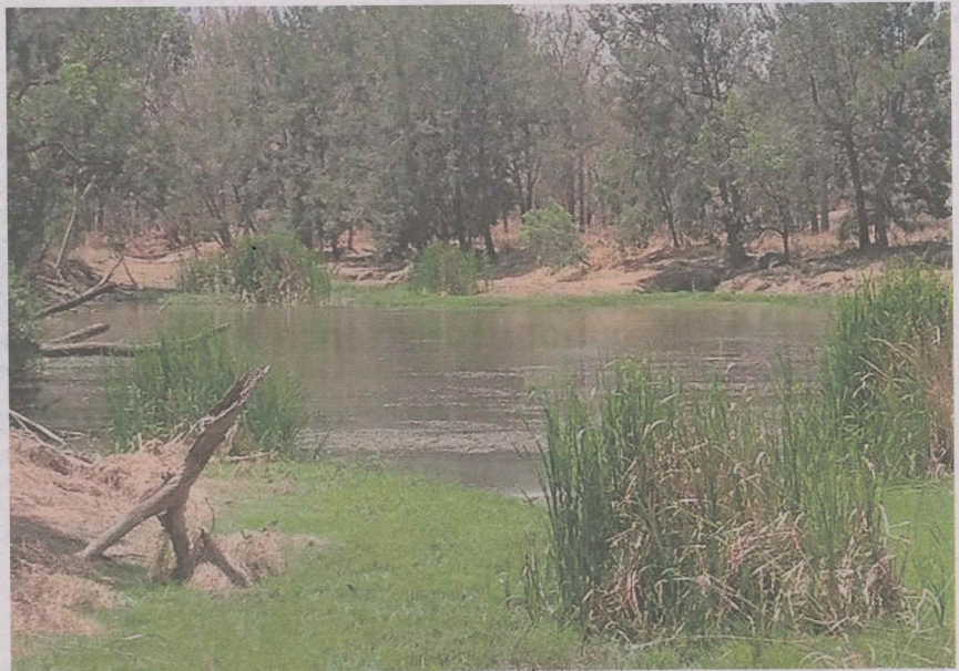
MURKY WATERS: The Lilyvale Waterhole.